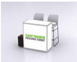
Standard display counter

Offered to Exhibitors or Silver Sponsors