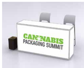
Upgraded display counter